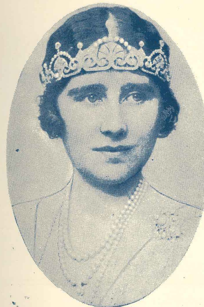
Her Majesty the Queen Elizabeth Angela Marguerite: Wife of George the Sixth: youngest daughter of Claude George Bowes-Lyon, fourteenth Earl of Strathmore and Kinghorne