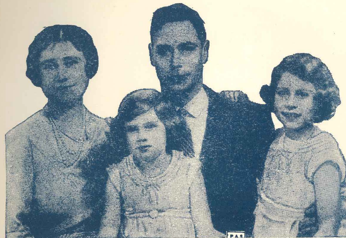
The new King . . . . the Queen . . . . and the Princesses

Compliments of THE PROVINCIAL GAS COMPANY, LIMITED