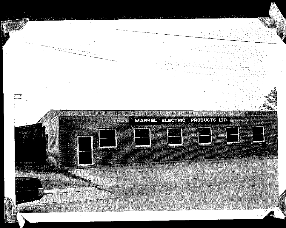
The Markel Electric Bld. Courtwright St. Port Erie.

The Company came to town in 1932. Pictured is their new office building, fronting the plant on S.S. of Lewis st.