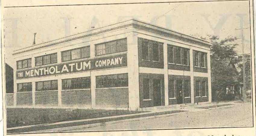
The picture shows the Canadian branch plant of the Mentholatum Company which has been established at Bridgeburg for approximately 25 years. The company was one of the first to realize the value of a branch on the Canadian Niagara Frontier