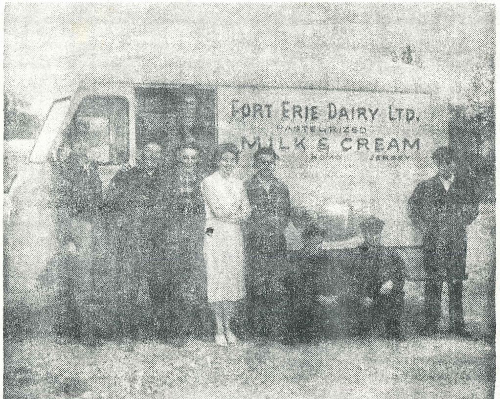
THE STAFF OF FORT ERIE DAIRY ARE YOUR NEIGHBORS