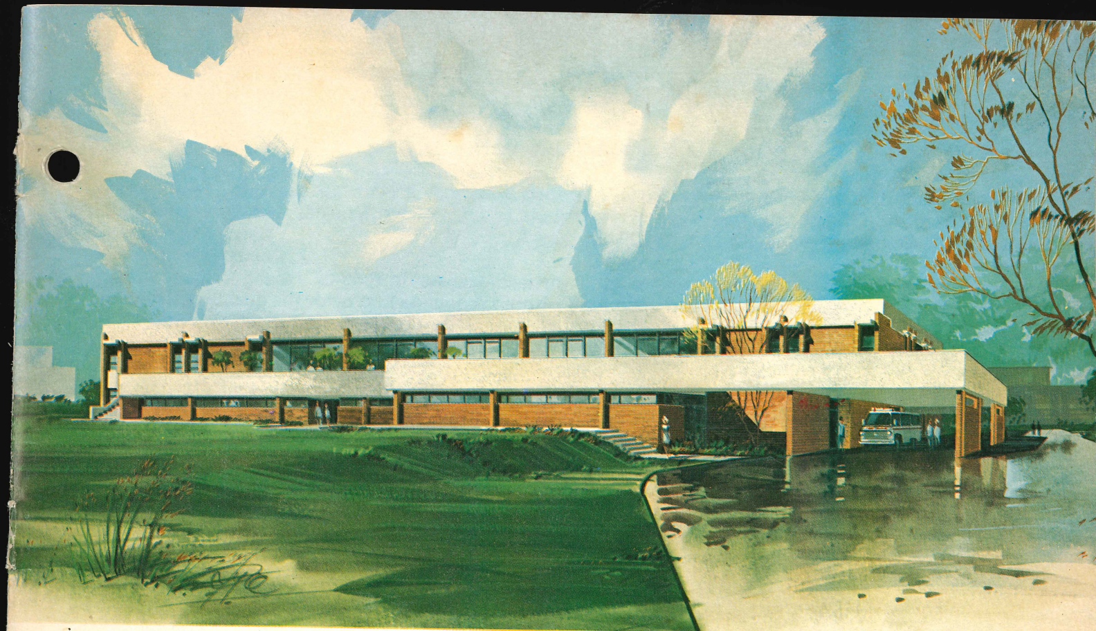
Douglas Memorial Hospital Fort Erie/Ontario